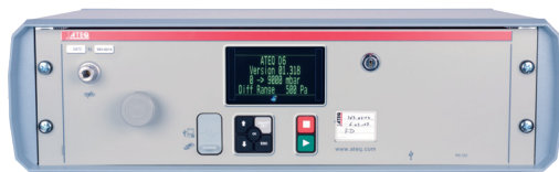
D670 19"3U case