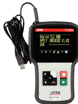
TLC 600 Remote control