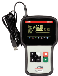
TLC 600 Remote control