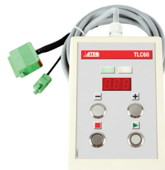
TLC 60 Remote control