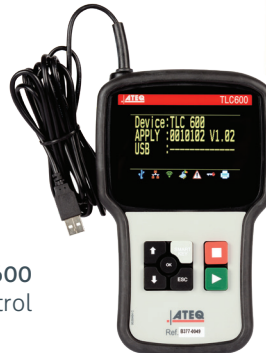
TLC 600 Remote control