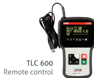
TLC 600 Remote control