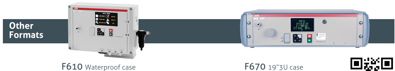
F610 Waterproof case