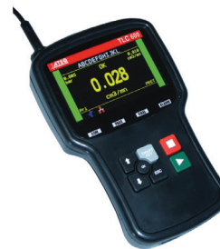
TLC 600 Remote control