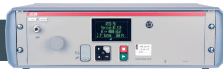
F670 19"3U case