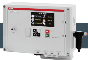
F610 Waterproof case