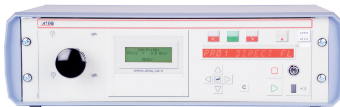
MF520 19"3U CASE