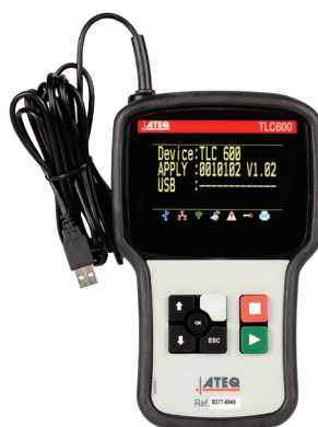
TLC 600 Remote control