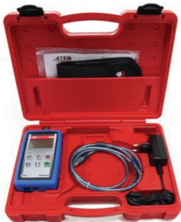
Leak Flow calibrator CDF60 (accessory)