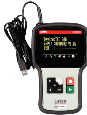
TLC 600 Remote control